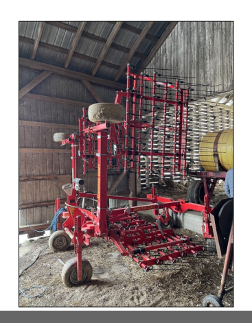
This fact sheet is provided as a courtesy. Information included is believed to be accurate & has been provided to us by the consignor. John M. Hess Auction Service is not responsible for any clerical errors or misrepresentations by consignor in above printed materials. The purchaser is responsible to research and verify any and all information regarding this property.