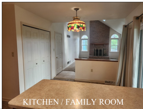
KITCHEN / FAMILY ROOM